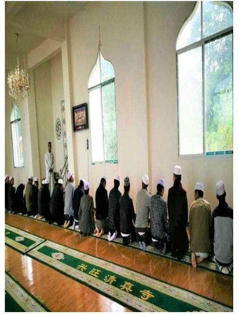
The new Prayer Hall