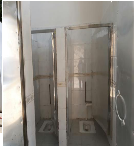
Toilet and wudu facilities