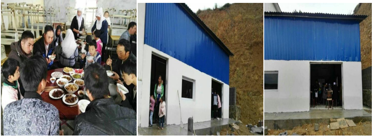
Make shift Kitchen ready in time for Eid Fitri 2017